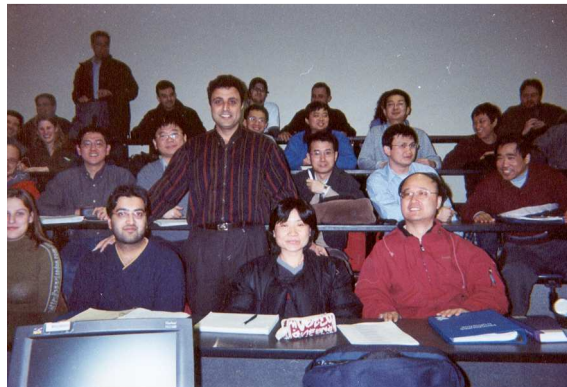
Celebration of ending the course (MECH6061/463), Concordia University, Montreal, Canada